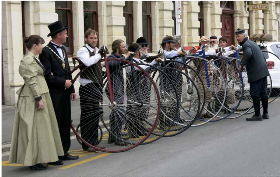
The mayor and his wife joined the Penny riders who completed the epic trip.